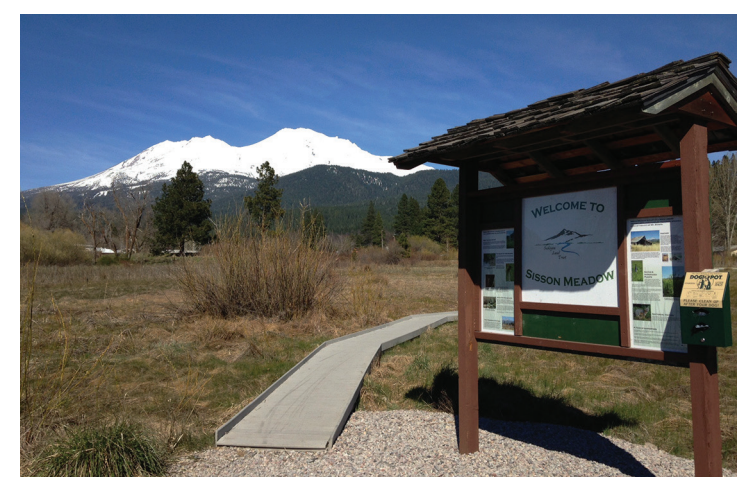
The main entrance of Sisson Meadow from Castle Street.

The restoration of Sisson Meadow began in 2003 after Siskiyou Land Trust purchased the property to protect it from development. Up until 1960, the meadow was