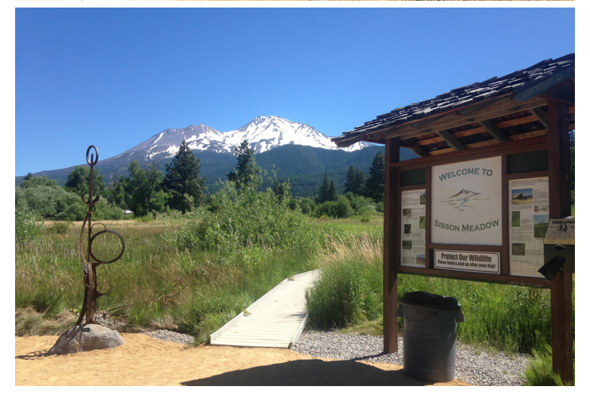
Sisson Meadow restoration began in 2002 and a community celebration and opening ceremony was held in May 2003. This community project has involved a number of partners and volunteers over the years and will continue into the future.