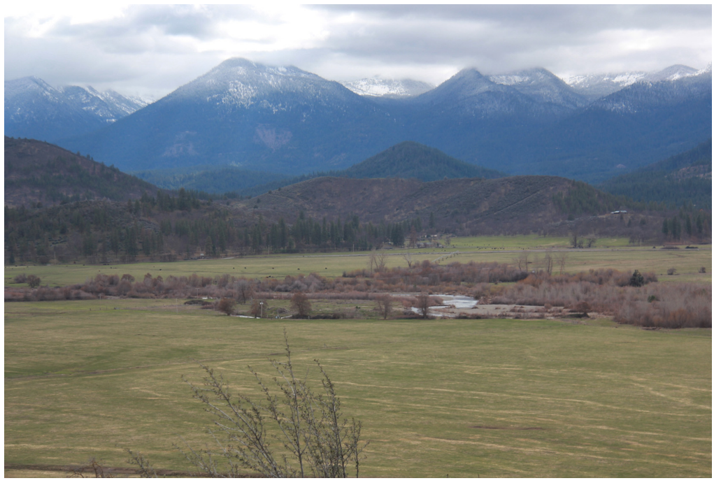
Looking out over the Scott Valley, a focal point of SLT's Conservation Strategy, where SLT holds a cluster of conservation easements.

• Use mapping products to develop a Conservation Strategy that identifies key resources across the County and highlights places where we can connect existing and potential projects to create larger conserved regions and resources. Work to balance these larger private projects with