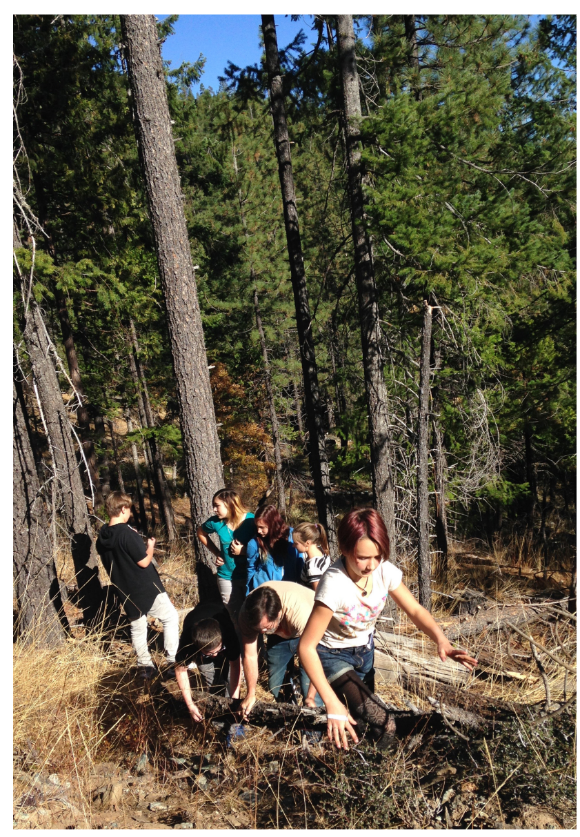
Middle school students hike on Rainbow Ridge during outdoor education field visits that included learning about owls and bats, and providing some help to the landowner in her work to support wildlife.