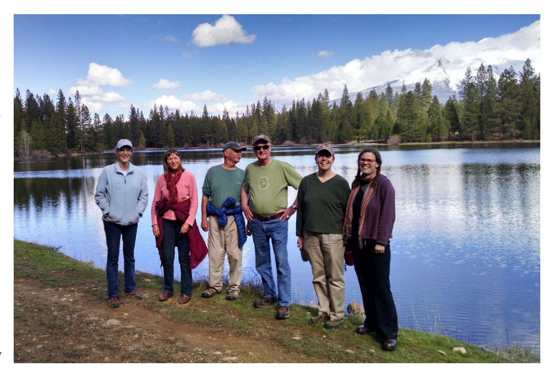
Visiting Hammond Pond, where SLT's steward monitors wildlife and their habitat and engages neighbors in stewardship activities.